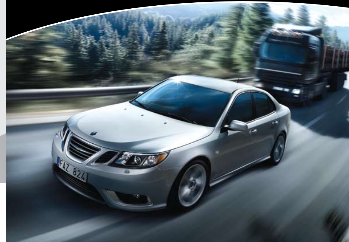
The Saab 9-3 Aero with XWD technology